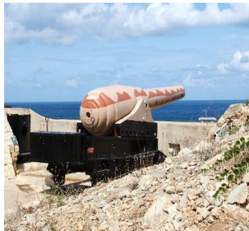
Canon Armstrong at Fort Rinella

Search on Wikipedia : Fortifications of Malta (British Fortifications 1800-1979).