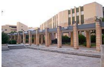
University of Malta